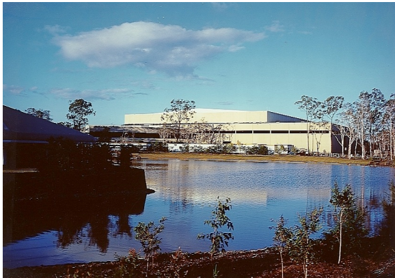
Boondall Entertainment Centre, 15,000 max capacity