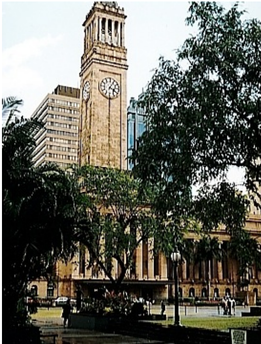
Brisbane City Hall Restoration

Herbert Mitchell & Associates, Brisbane Rawlinson Roberts, Perth, W.A.