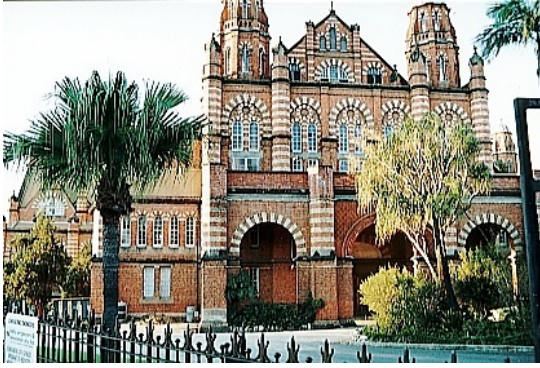
Old Queensland Museum – heritage listed refurbishment