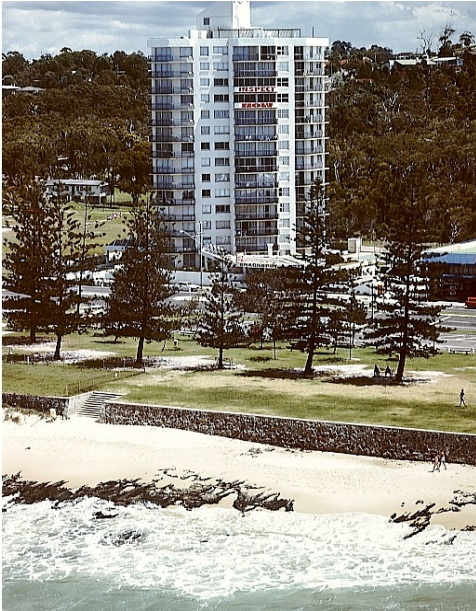
Sunshine Coast Residential Tower