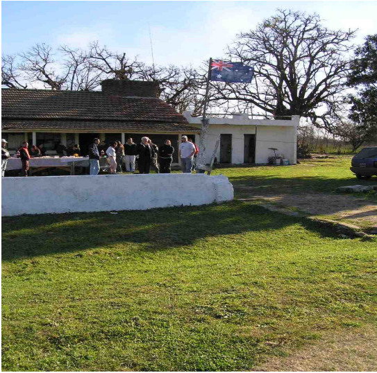
Nuevo Horizonte Juvenil , Moreno, Argentina