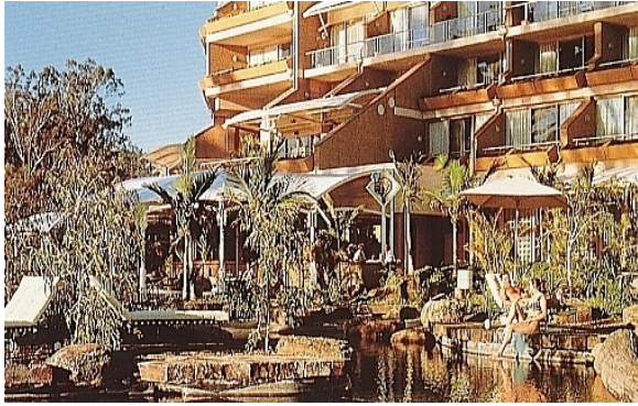
The Kooralbyn Hotel – 5 storey rammed earth construction