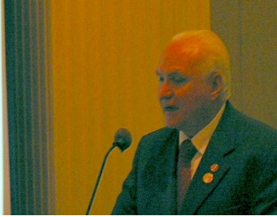
Quantity Surveying membership reciprocity between Australia and Canada

WELCOME TO 45 th CIQS AGM VANCOUVER, BC JUNE 19, 2004