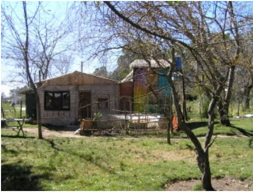
Civil Los Honeros, Moreno, Argentina School house