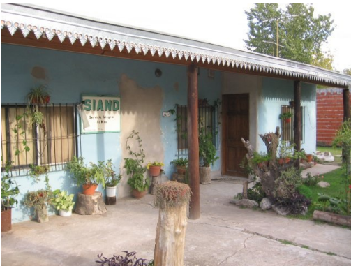
Siand foster home, Buenos Aires