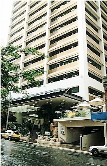
127 Creek Street, Office block redevelopment